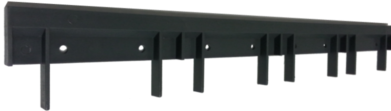
Wall mount bracket